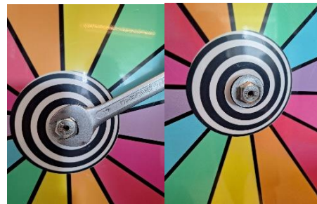
2. Attach parts to board with wrench no. 17