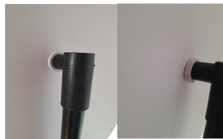
4. Assemble parts to board and connection tube