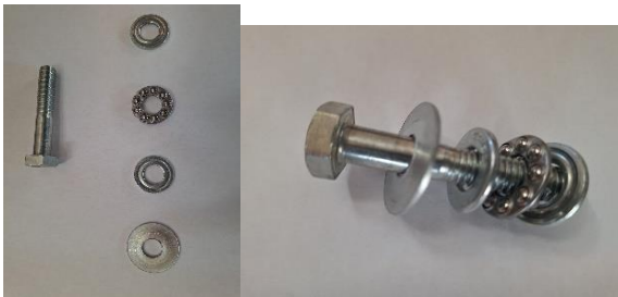
1. Assemble parts in order shown above