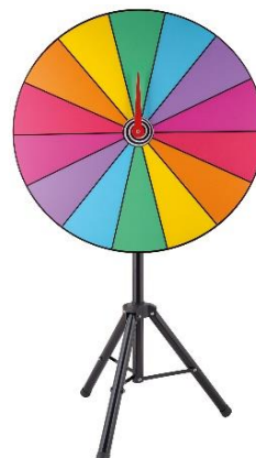
6. Position board on foot. Your product is ready for use.