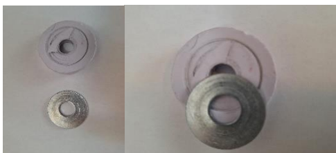
3. Position parts in order shown above